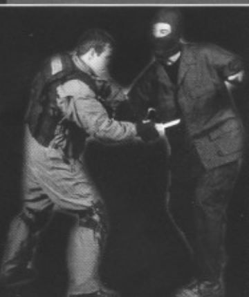
• MAJOR AVI NARDIA TALKS ABOUT CLOSE QUARTER BATTLE (CQB)